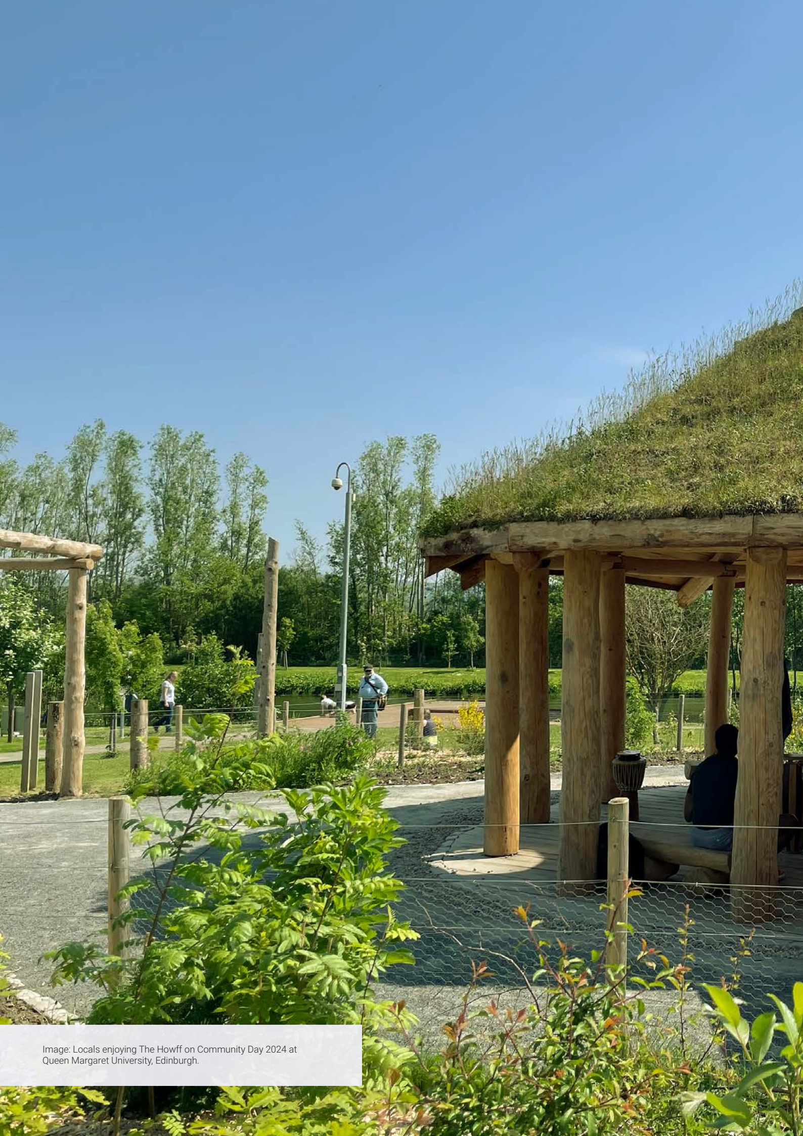
Image: Locals enjoying The Howff on Community Day 2024 at Queen Margaret University, Edinburgh.