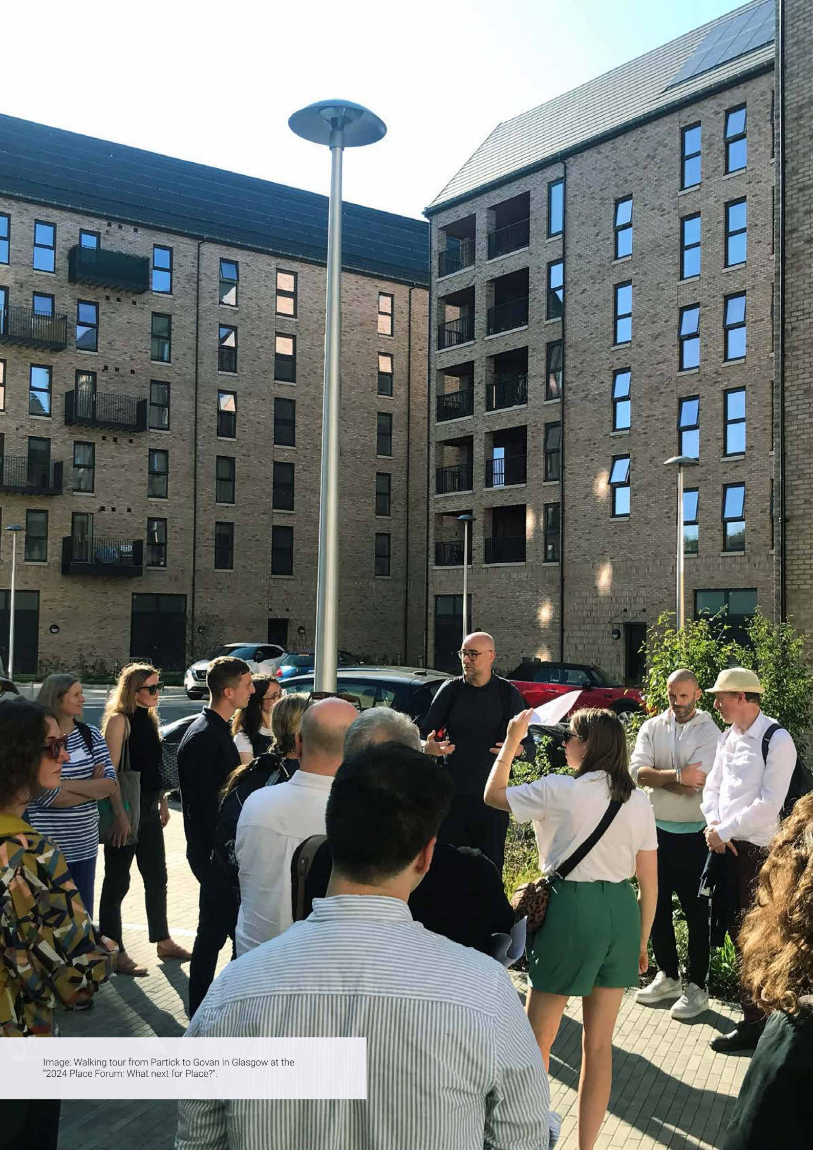
Image: Walking tour from Partick to Govan in Glasgow at the "2024 Place Forum: What next for Place?".