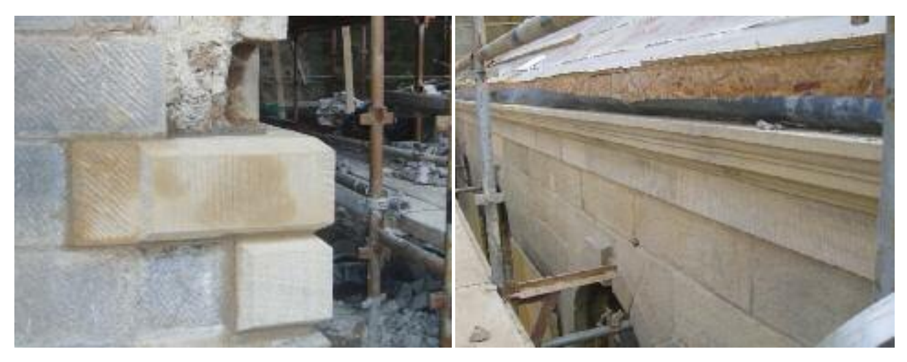
With thanks to Elder and Canon Architects for imagery