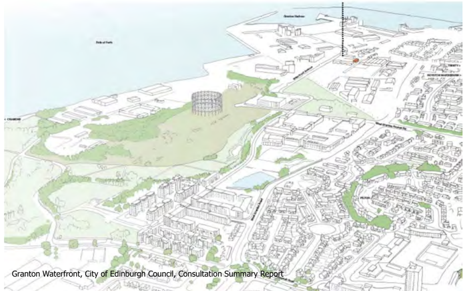
Granton Waterfront, City of Edinburgh Council, Consultation Summary Report

Edinburgh's waterfront is identified as a key priority in the Economic Strategy for the city. A&DS has facilitated City of Edinburgh Council workshops to develop strategic ambitions with partners, to shape a learning strategy with Scottish Futures Trust for the area and has supported the development of the spatial strategy with design advice. Once delivered, the waterfront project will deliver over 800 homes, new parks, mixed use and business spaces and enhanced learning opportunities for the local area and city.