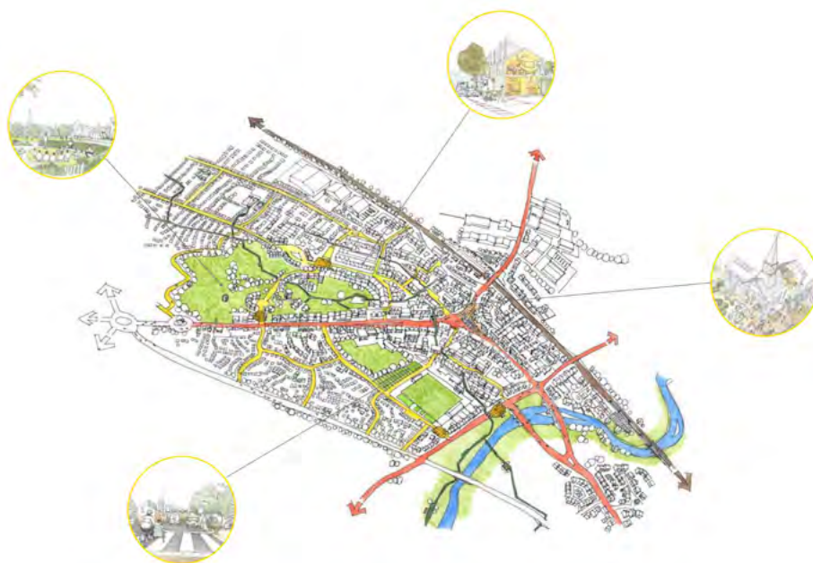
Visualisation of: Town Centre Living: A Caring Place

Building on the Caring Places work A&DS are contributing to a number of Scottish Government groups including: Intergenerational and Co-living Working Group; Connected Scotland National Advisory Group; and support to the Town Centre Fund 2019-20.