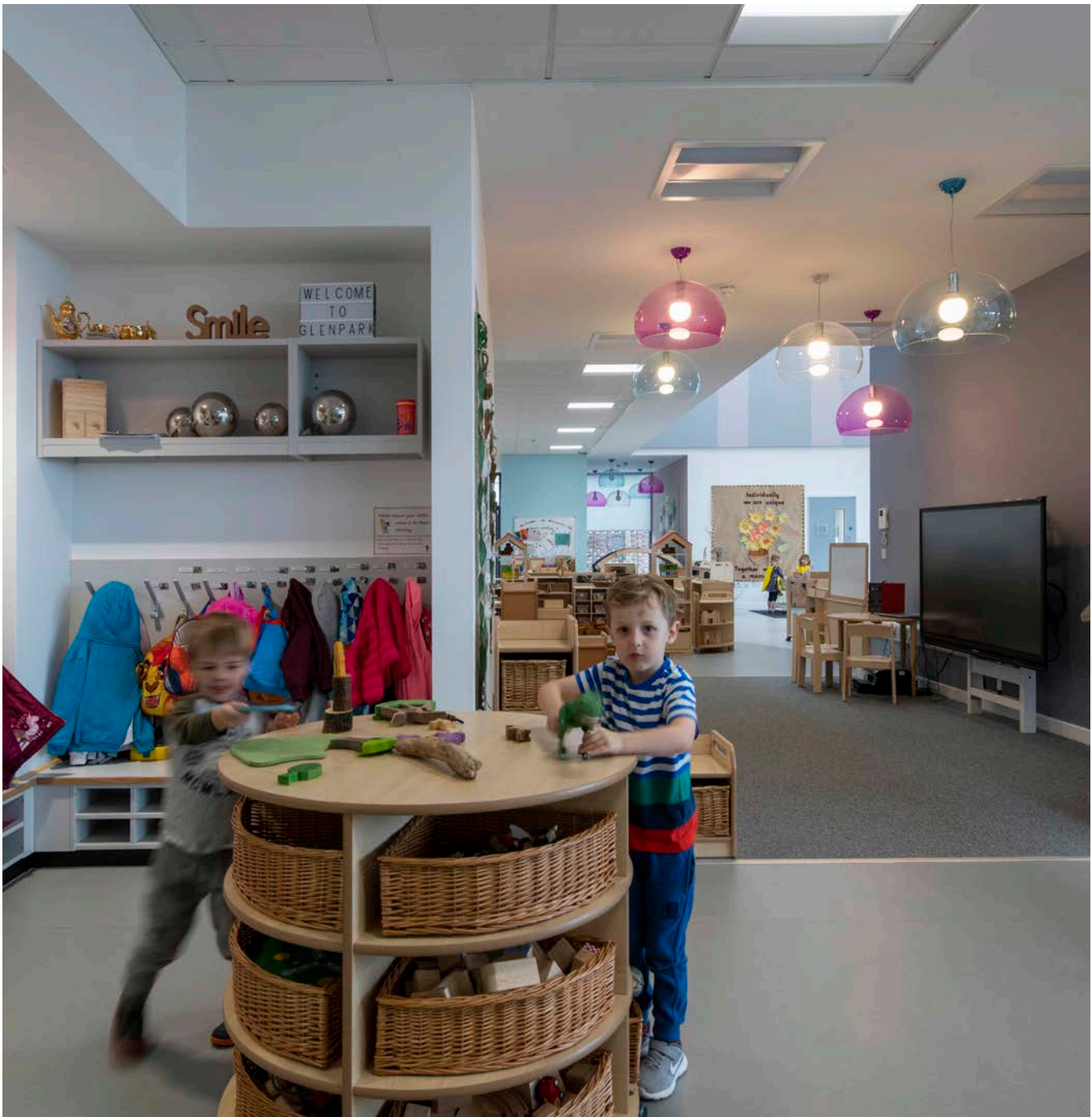
Glenpark Early Years Centre, Greenock