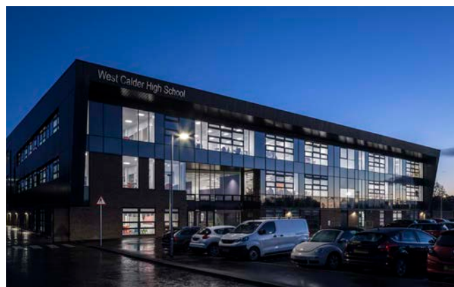
West Calder High School: NORR Architects