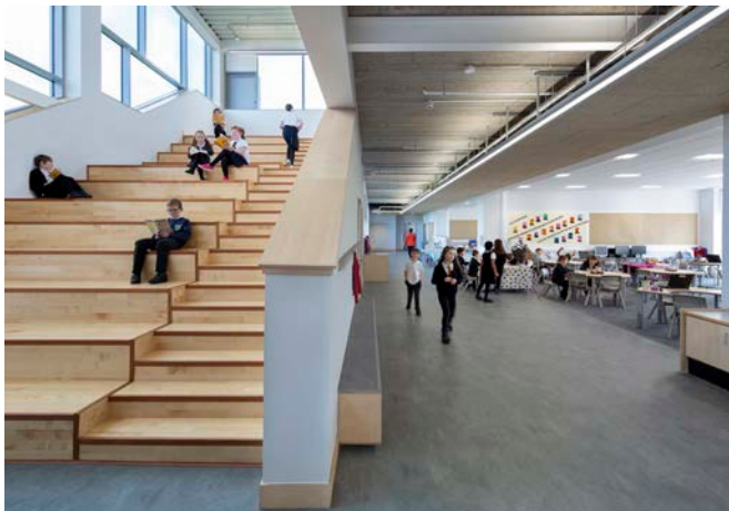
Alyth Primary School.

What the judges say: “Very innovative with consistent quality of design and materials. They take into account good design from around the globe to incorporate into forward thinking designs.”