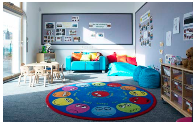
Ladyloan Primary School

Flagship projects: Bertha Park (See page 14), Ladyloan Primary, Muirfield Primary