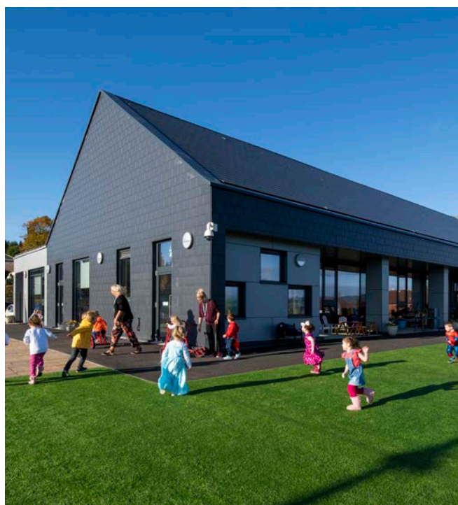
Glenpark