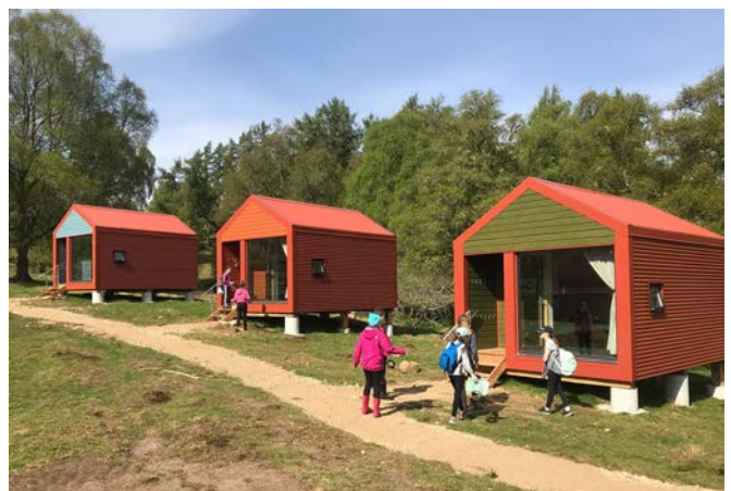
The Shieling Project