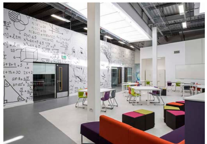
West Calder High School - NORR Architects

Flagship projects: Queensferry High School, West Calder High School (see page 16)