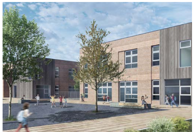
Wallyford High School.

Flagship projects: Alyth Primary School, Largs Academy Campus with community facilities; Wallyford High School and Primary; Invergarven School (ASN)