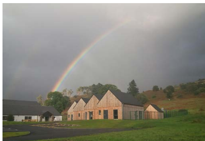
Strontian Community School Building Ltd.