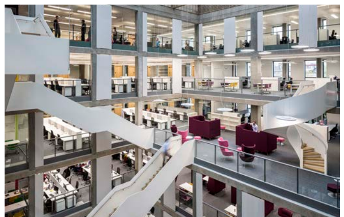
Hawkins Brown Architects