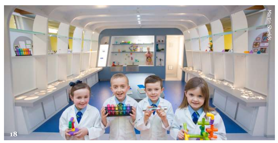
Project 14: Vocational skills academy

The story: A vacant school annex has been turned into an innovative purpose-built facility to offer CPD for teachers. Two teaching rooms mimic a modern teaching environment, one based around collaborative work, the other for individual work. The aim is to create a pleasant environment with high-quality facilities which teachers feel good about being in, offer research-based training and pilot new approaches. Teachers have welcomed opportunities to work collaboratively, share good practice and develop professional networks. Early evaluations show positive impacts on staff, resulting in benefits for pupils.