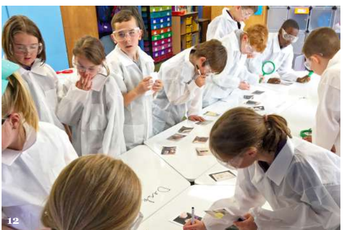
Project 10: Learning Spaces of the Future

Aim: To adapt old spaces into innovative environments to explore new approaches to teaching and learning.