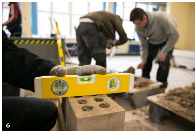
Project 4: An engineering academy

Aim: Providing increased training options for senior pupils.