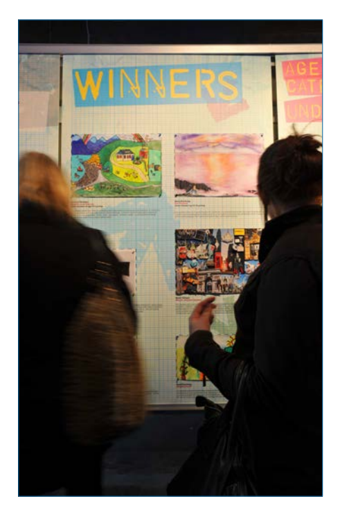
'Our Perfect place to Play' exhibition, the Lighthouse 2010

To deliver Strategic Objective 3 we will communicate the value of good architecture and place in a way which seeks to inspire better outcomes for Scotland and promote the best in sustainable placemaking.