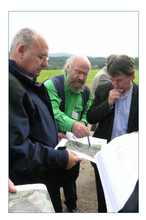
Design Review site visit

Scotland enjoys a rich inheritance of buildings and places whose diverse character contributes so much to our national identity. In managing and adapting this legacy we have the opportunity to learn lessons from those places which have endured and apply these lessons to support sustainable new places in challenging times.