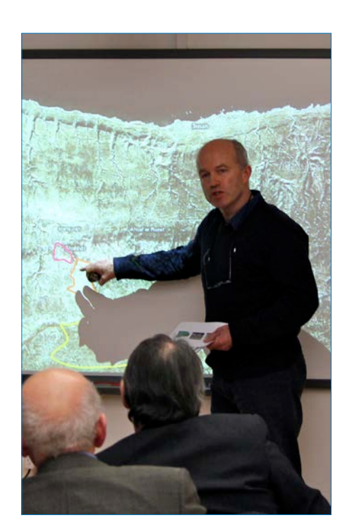
A+DS Design Review Panel training day 2011

To deliver Strategic Objective 2 we will offer advice on a selection of development proposals at a range of spatial scales.