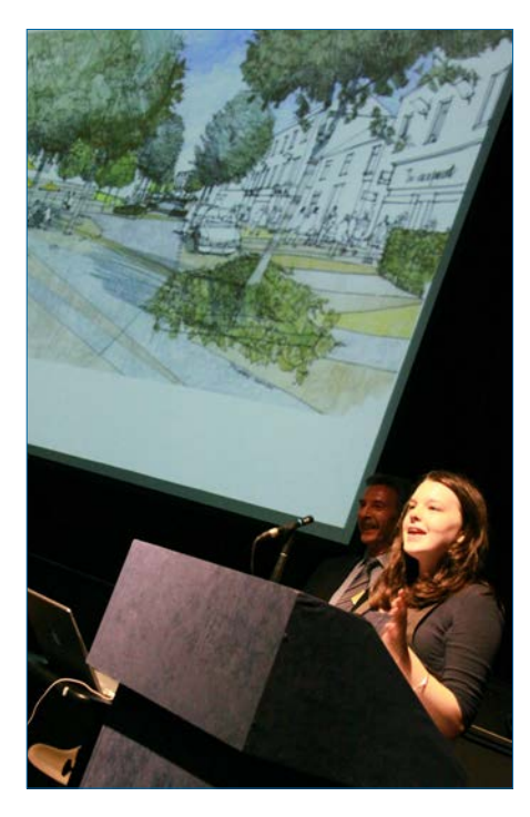
Launch of the Neilston Town Charter, as developed by the community of the town with the support of East Renfrewshire Council and A+DS

To deliver Strategic Objective 1 we will identify key organisations, communities and individuals to work with to change our approach to placemaking in Scotland. Through our Health and Schools programmes we will work with funders, clients, design teams and others to achieve high quality public buildings and infrastructure in Scotland.