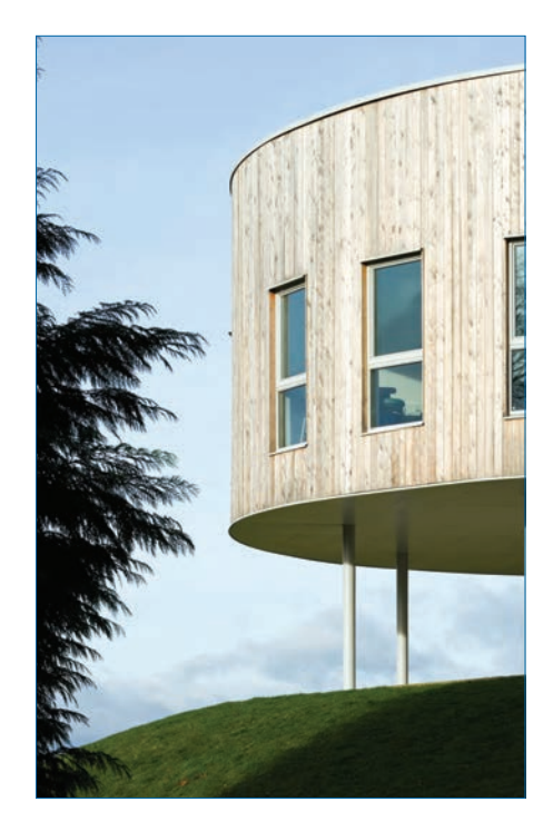
Dumfries Dental Centre