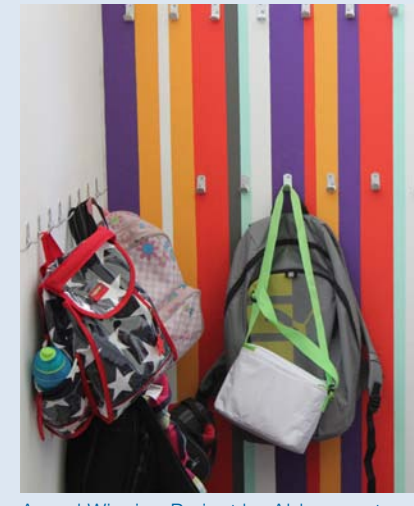
Award Winning Project by Abbuzzo at Hyndland After-School Club.

Share what works in order to promote an informed debate on school design.