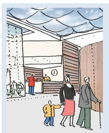
An illustration from 'Circulation in multiservice facilities' design study. Illustration: JMArchitects