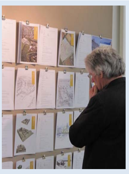
Design Forum reports.

Undertaking a series of masterplan workshops, working collaboratively with other programmes and key agencies to deliver training to Local Planning authorities in order to deliver findings from Design Review Lessons Learnt on Masterplanning.