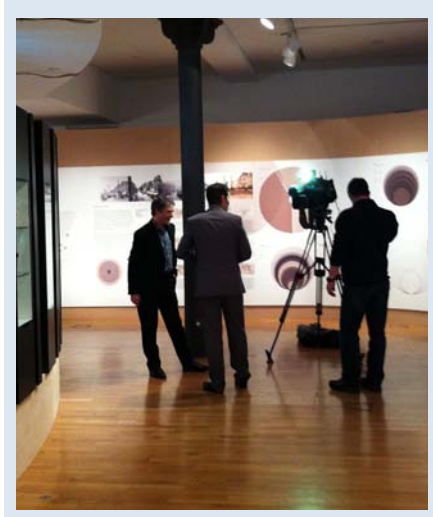
Media interview at A+DS exhibition.