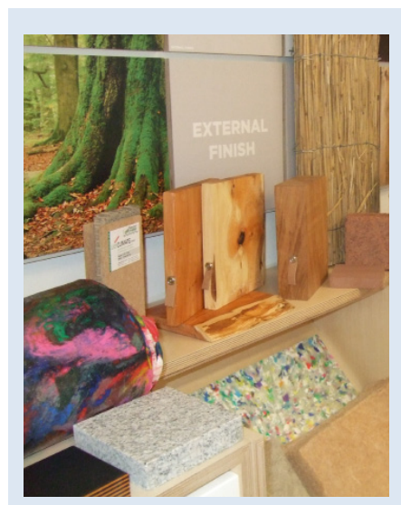
Material Considerations: Library.