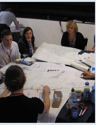
Participants at Design Skills Symposium 2011

Leadership and Place: development of a programme focussed on leadership to fit into the Design Skills Symposium.