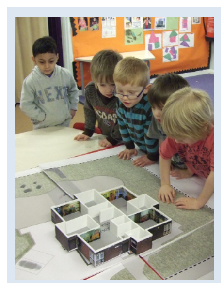
Engaging with architecture at a preschool workshop.