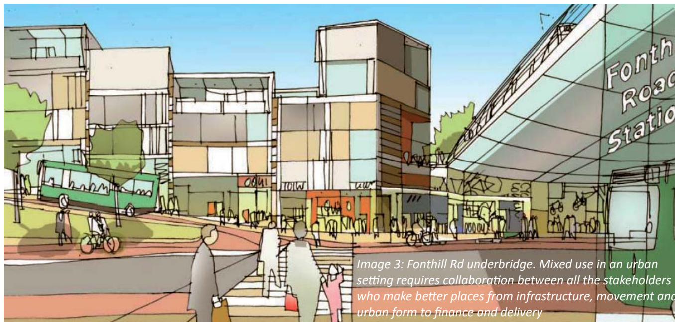
Image 3: Fonhill Rd underbridge. Mixed use in an urban setting requires collaboration between all the stakeholders who make better places from infrastructure, movement and urban form to finance and delivery

Land Ownership: Land ownership, fiscal and investment boundaries should not lead to separation of elements and uses, rather the aim should be to identify and address the street block and building plots in a comprehensive way so as to take account of the wider place making context and strategic opportunities that arise. The willingness of landowners to see a high quality mixed use place on land they own is crucial.